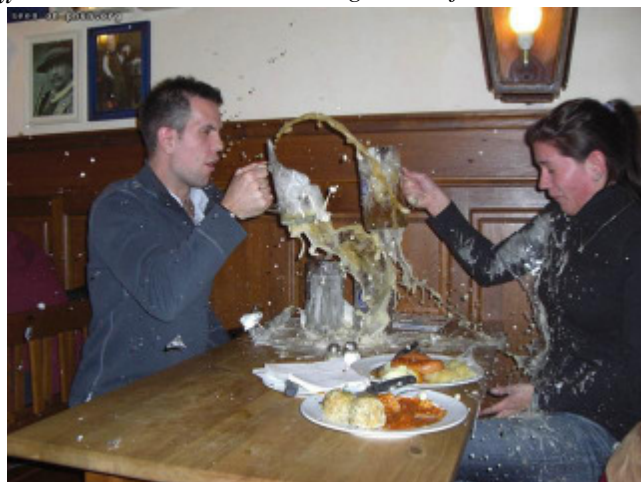
A toast that got out of hand

In a study by University of Wisconsin, it was found that moderate consumption of Guinness worked like aspirin to prevent clots that increase the risk of heart attacks. Guinness proved twice as effective as Heinken at preventing blood clots. Guinness is loaded with flavonoids, antioxidants that give the dark color to many fruits and vegetables. These are better than vitamins C and E at keeping bad LDL cholesterol from clogging arteries. Blocked arteries also contribute to erectile dysfunction. Beer also aids bones because of its high levels of silicon, which allows the deposit of calcium and other minerals into bone tissue. Many cardiologist recommend a drink a day for cardiac patients. Red wine in particular has been shown to help prevent heart attacks. Beverly Fizzell