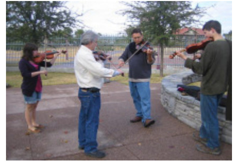
Students practicing outside the hall.

and potluck was December 5th, and a seisiun was encouraged. We first played for dinner and then went and played in the cottage while they held their meeting. Several members peeked in to listen after their meeting. The accoustics in the cottage are great!